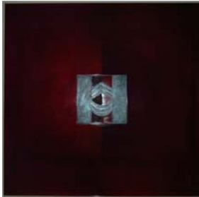
BILLY AL BENGSTON Boris , 1961 Oil on Masonite 48 x 48 in. 121.9 x 121.9 cm BENBI3