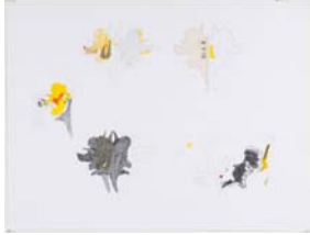
ED MOSES Iris Series #1 , 1964 Graphite on paper 19.5 x 25.5 in. 49.5 x 64.8 cm