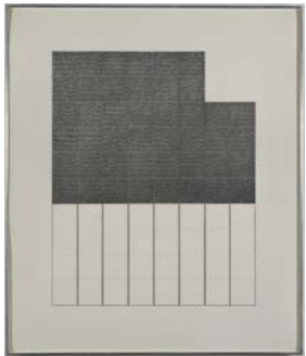
ED MOSES OCD Series #1 , 1966 Graphite on paper 27.5 x 23.5 in. 69.9 x 59.7 cm