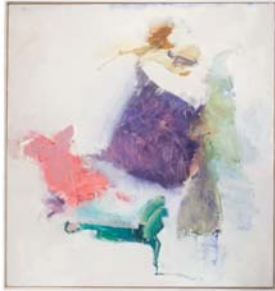
JOHN ALTOON Untitled , 1963 Oil on canvas 61.375 x 58 in. 155.9 x 147.3 cm framed ALTJO6