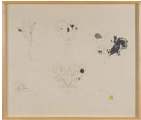
ED MOSES Iris Series #3 , 1964 Graphite on paper 22.75 x 26.5 in. 57.8 x 67.3 cm