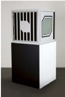
LARRY BELL L. Bell's House, Part II , 1962 - 1963 mirrored glass and wood, on artist's formica base 25 x 25 x 25 in. 63.5 x 63.5 x 63.5 cm