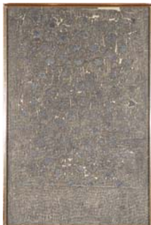
ED MOSES Rose #6 , 1963 graphite & acrylic on Strathmore board 61 x 46 in. 154.9 x 116.8 cm