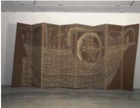
TIM HAWKINSON (1960-) Crow's Nest , 1998 Pastel, Pollen and beeswax on paper on polystyrene substrate 144 x 384 x 1 1/2 in. 365.8 x 975.4 x 3.8 cm

I made pastel rubbings on craft paper of a wooden deck containing a hot tub. The rubbings were reassembled into this three-masted sailing ship. The hot tub, with pump, filter, and water heater, is the ship's crow's nest.