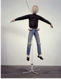
TIM HAWKINSON (1960-) Fat Head Balloon Self-Portrait , 1993 Studio clothing, latex, air, and basketball hoop 101 in. x 70 in. x 40 in. 256.5 x 177.8 x 101.6 cm

Rubber "skins" lifted from my head, hands, and knees, welded into a rubber-sealed body made up of shirt, pants, and socks, inflated with air, and suspended in a basketball hoop.