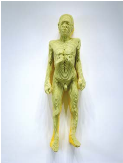
TIM HAWKINSON (1960-) Prototype for Pentecost , 2000 urethane foam 70 x 22 1/2 x 14 in. 177.8 x 57.2 x 35.6 cm

Rubber "skins" lifted from my head, hands, and knees, welded into a rubber-sealed body made up of shirt, pants, and socks, inflated with air, and suspended in a basketball hoop.